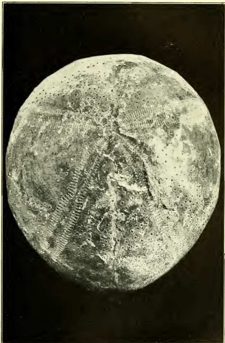
Eupatagus mexicanus , new species, Mesón formation, Hacienda Santa Fé, Topila, Mexico, Corona collection no. 1, holotype, dorsal view, U.S.N.M. no. 496281. The figure is slightly foreshortened. (Five-sixths natural size.)